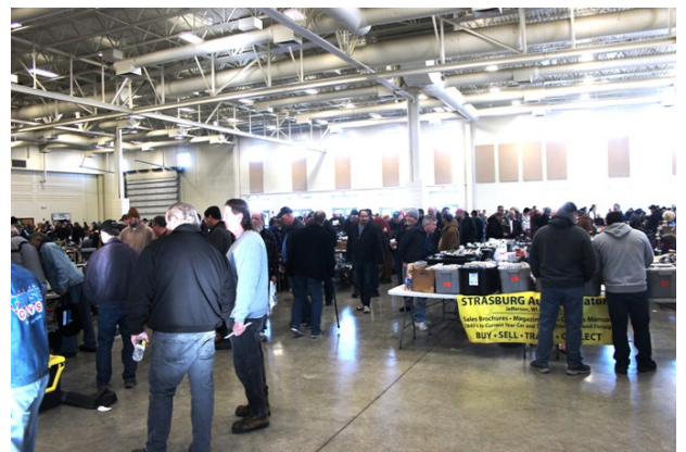
Washington County Fair Grounds

The 2023 Model A Swap meet marks the beginning of the 'new' old car driving season, or the rites of spring. The Milwaukee Model T Ford club and Dairyland Tin Lizzies were there in force. As it goes, twelve of us got up extra early and stopped at the Saw Mill Restaurant in Richfield for breakfast. You just can not walk through a swap meet on an empty stomach. We all had a good time discussing what we did over the winter and planned on for the up coming driving season. Besides the food was plentiful and good tasting. We left the restaurant about 8:30. The swap meet opens at 8:00, so we arrived fashionable later and missed the initial line up for admission, standing in the cold. This year, as in the past couple of pandemic years, the number of vendors and the crowd was reduced. There seemed to be less merchandise of the Model T and Model A era, but that didn't stop anyone from looking at each and every table, snooping through all the boxes and items hidden under the tables. Besides the thrill of the hunt for those long needed parts, you also meet other Old Car friends along the way. Seems we all have succumbed to the Old Car Hobby affliction. Go to Page 8.